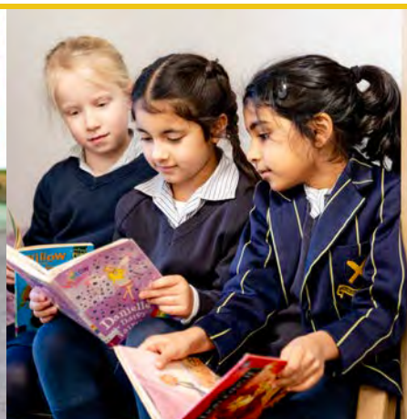
Deputy Head Academic (Prep)