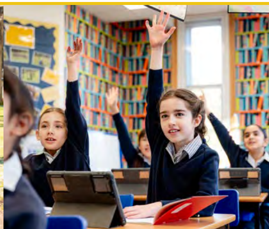
Deputy Head Academic (Prep)